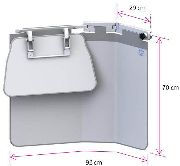
312/E-012 Weight: 10 kg

Weights and dimensions are subject to manufacturing tolerance