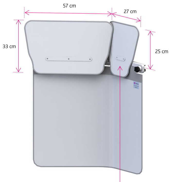
Optional top shield 312/DS/3.30 Weight: 0.9 kg