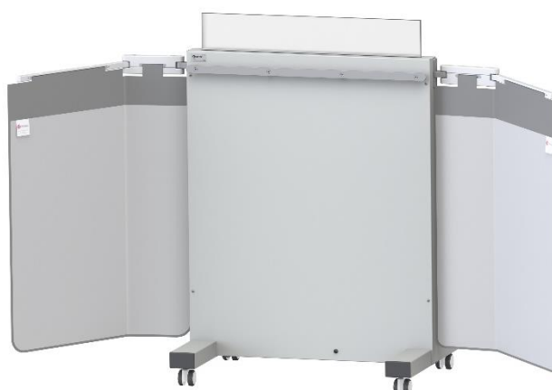
Model 310/B-3 plus 2 x model 317/05-001 (total width: 214 cm)